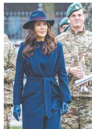
Queen Mary of Denmark

Mary, 52, paid tribute to the servicewoman in her address to military personnel.