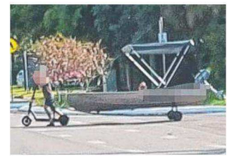
The youngster towing a boat, via their e-scooter.

Expressions of interest in the property portfolio close at midday on May 1. The sale is not expected to impact current tenants of those buildings.